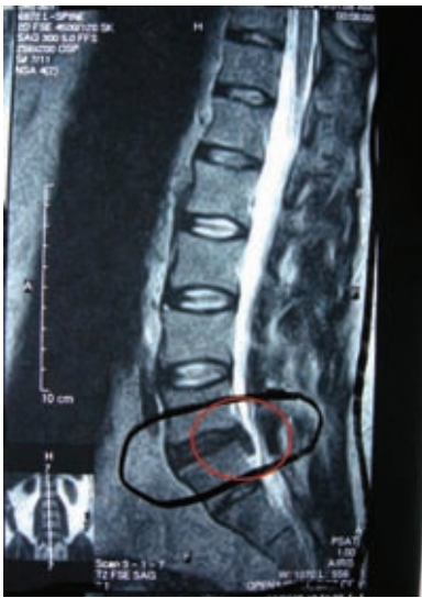
Figure 1a: Pre-treatment MRI (02/02/05)