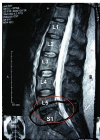
Figure 1b: Post-treatment MRI (14/03/05)